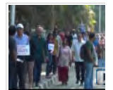
Massive protest against steel flyover in Bengaluru...

Subscribe - Deccan Herald's YouTube channel