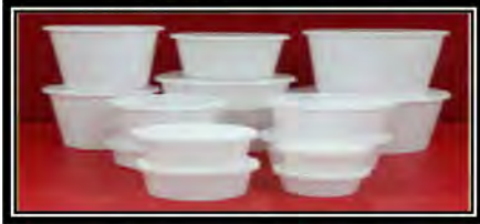
Single use Plastic Bowls