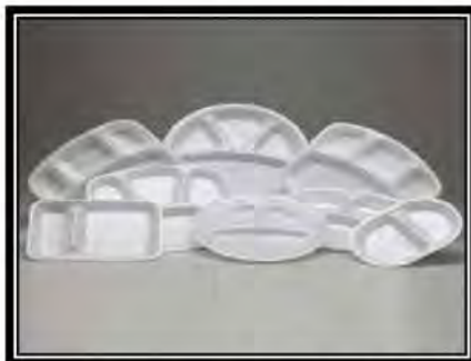
Thermocol/ Styrofoam Cutlery Plates