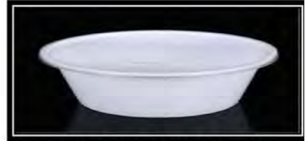
Single use Plastic Bowl