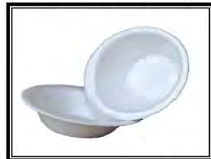
Thermocol/ Styrofoam Cutlery Bowls