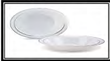
Single use Plastic Bowls