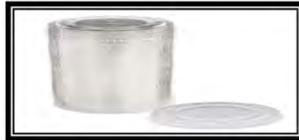
Single use Plastic Glass with Lid