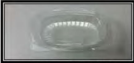
Single use Plastic Dish

(dish, bowls, trays, glasses, lids) less than 250 microns used for packaging/ covering of food/ liquid items.