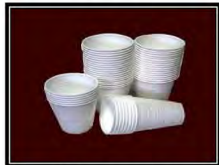
Thermocol/ Styrofoam Cutlery Cup