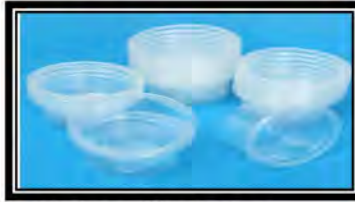
Single use Plastic Cups