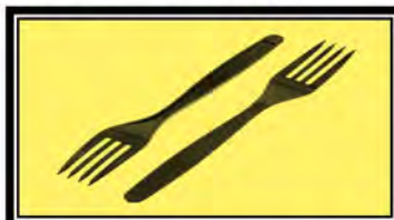
Single use Plastic Forks