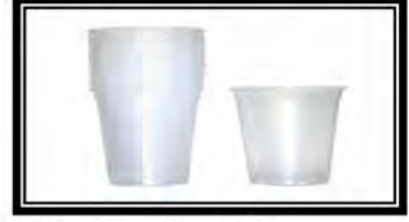
Single use Plastic Glass