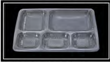
Single use Plastic Plate

(Plates, cups, glasses, bowls, forks, knives, spoons, stirrers and straws)