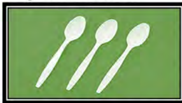
Single use Plastic Spoon