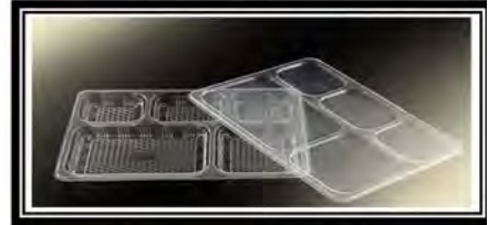
Single use Plastic Tray