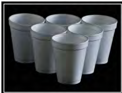
Thermocol/ Styrofoam Cutlery Glasses